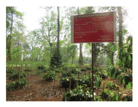
Plate 1: Experimental Field view

The mean relative humidity is 83.0%. The soil of the experimental area is red laterite and acidic in texture and this experiment was laid out in Factorial Randomized Block Design with three replicates. The details of the treatments are as follows. The spacing (S)treatments are S<sub>1</sub>-2.0x2.0 m , S<sub>2</sub>-1.5x1.5 m, S<sub>3</sub>-1.0x1.0 m and the foliar nutrition (F) treatments are F<sub>1</sub>-Humic acid @ 0.2%, F<sub>2</sub> – Panchagavya @ 3.0%, F<sub>3</sub>-NPK 19:19:19 spray @ 0.2%, F<sub>4</sub>-GA3 spray @ 20 ppm and F<sub>5</sub>-Control (Water spray).